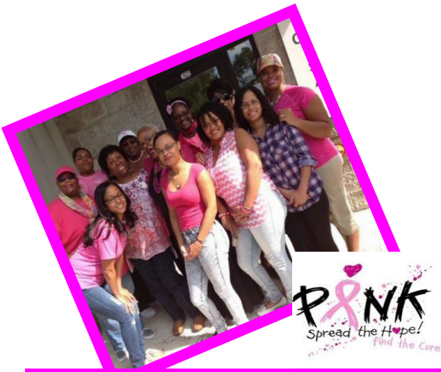
ECHSA, Inc. supports Breast Cancer Awareness!